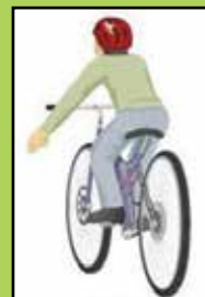
SLOW OR STOP